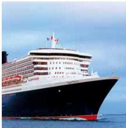
2 "Queen Mary 2", England