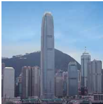
6 "International Finance Centre", China