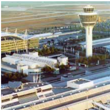
1 "Munich Airport Centre", Germany