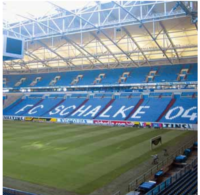
“VELTINS Arena” in Gelsenkirchen, Germany