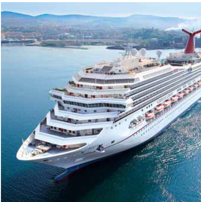
“Carnival Liberty” luxury liner, U.S.A