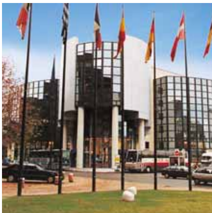
3 "European Parliament", France