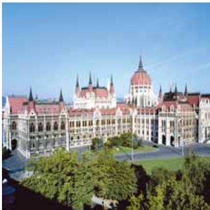
5 "Parliament Buildings", Hungary