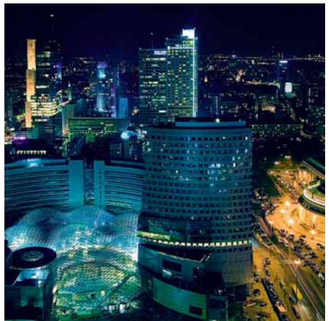
“Golden Terrace and Rondo 1” in Warsaw, Poland