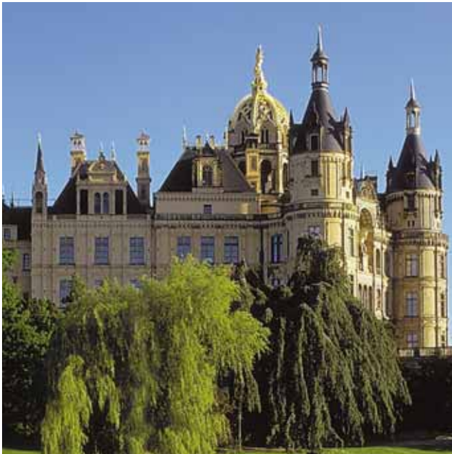
“State Parliament in Schwerin”, Germany